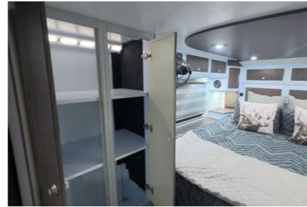
Generous wardrobe storage, thoughtfully designed to hold all his and her clothing and essentials