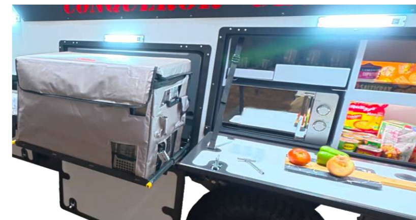
Large outdoor kitchen with every essential appliance at your fingertips — perfect for preparing meals while enjoying the adventure.