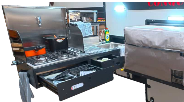
Conveniently laid-out kitchen, with instant hot water wash-up facility and easy to reach fridge. Everything has its place.