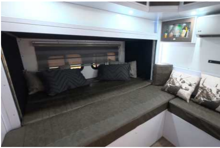
New patented and industry first large "Quick-Fold" Main Bed