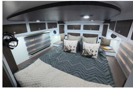
Spacious ultra-modern front bed with premium comfort and convenience