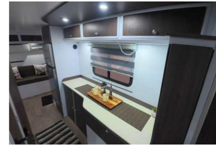
Spacious storage and a full-size stand-up fridge — everything within easy reach