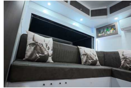
Spacious luxury lounge featuring full leather seating for superior comfort and relaxation